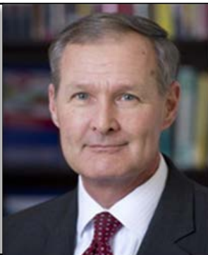
LTG David W. Barno USA, Retired Chairman Operational Reserve SC